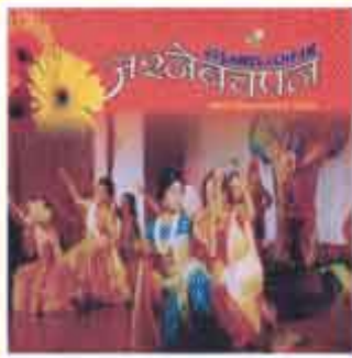
Humari Kahani Performance in Jashnayachpa

Pathshala an open school Project marked the opening of Literacy India. It started with the non-formal education of 5 children and has touched the lives of over 700 children. Pathshala aims to get a child to read and write within a time frame of 3 months to a year before they get into the formal school. Pathshala also helps students to cope with their studies in their formal education. The adult education wing was started last year with 35 adults. Following the National Literacy Mission, the Pratham module is showing great results. We always have a constant attendance of 130 children. PATHSHALA opens classes every summer also for the schools drop outs from various govt. schools. This non-formal schooling project has put many children back into to the formal stream.