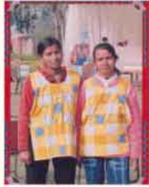
Literacy India' Stall at Chancellor Club on the Eve of Christmas