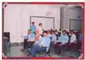
New Basic Literacy center at Dharu Hera

Like the last quarter, we opened two new centers - one Karigari center in Ishapur Khera on the 23rd Nov 2004 and an Adult education center in Dharu Hera in association with Omax India Ltd. Furthermore, we started Beauty Centre in H-Block Palam Vihar with 10 girls and intend to start soon the same in Bajghera.